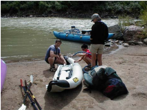
Colorado River Rafting Trip